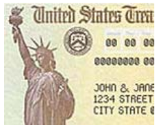
Homeowners Get a Bailout This Year Lifestyle Journal