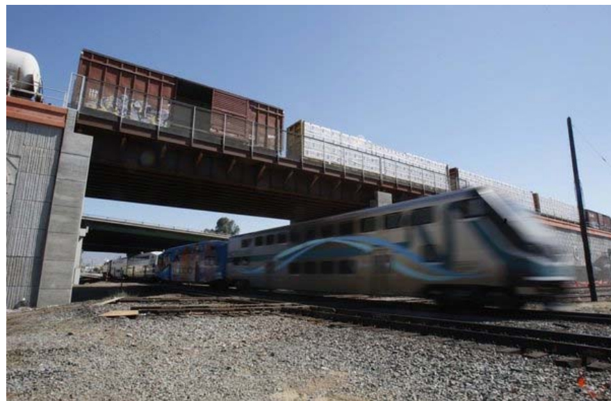
Metrolink commuter rail service will be extended to Perris, in Riverside County, aided by a $75-million federal grant announced Monday.

Comments 5 Email Share 13 Tweet 6 Like 7 +1 3