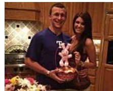
Johnny Manziel and His Girlfriend In 10 Great Photos