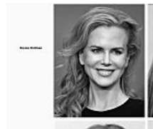
Stars Who Went to High School Together Elle