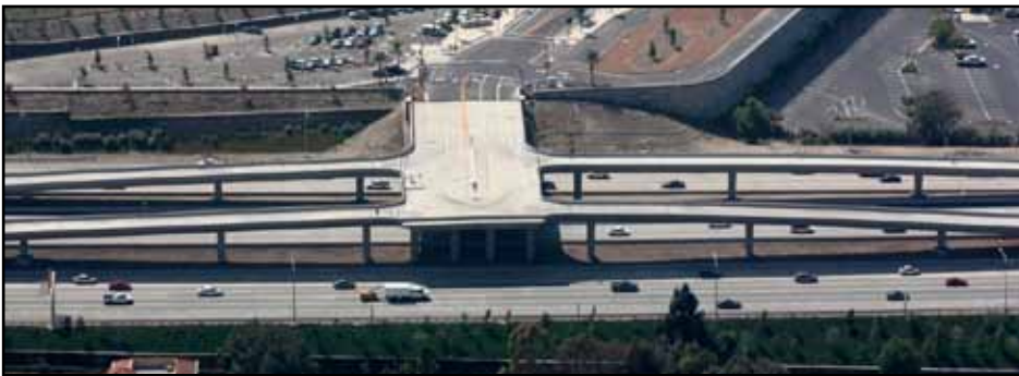
Direct Access Ramp at the Rancho Bernardo Transit Station

The Interstate 15 (I-15) Express Lanes will provide a four lane, 20 mile express lane facility in the median of I-15 stretching from State Route 163 (SR-163) north to State Route 78 (SR-78). The I-15 Express Lanes is the first adaptable, high-tech transportation facility configured to meet the diverse needs of local travelers, commuters and commerce in the San Diego region. The new express lanes will be available for free to transit, carpools, vanpools, motorcycles, and permitted clean air vehicles. For a fee, single occupant vehicles will also be able to travel on the Express Lanes using the FasTrak® electronic tolling system. Once the I-15 Express Lanes are completed, a new Bus Rapid Transit (BRT) System is anticipated to open in early 2013 and will provide high frequency transit service that is the first of its kind in San Diego.